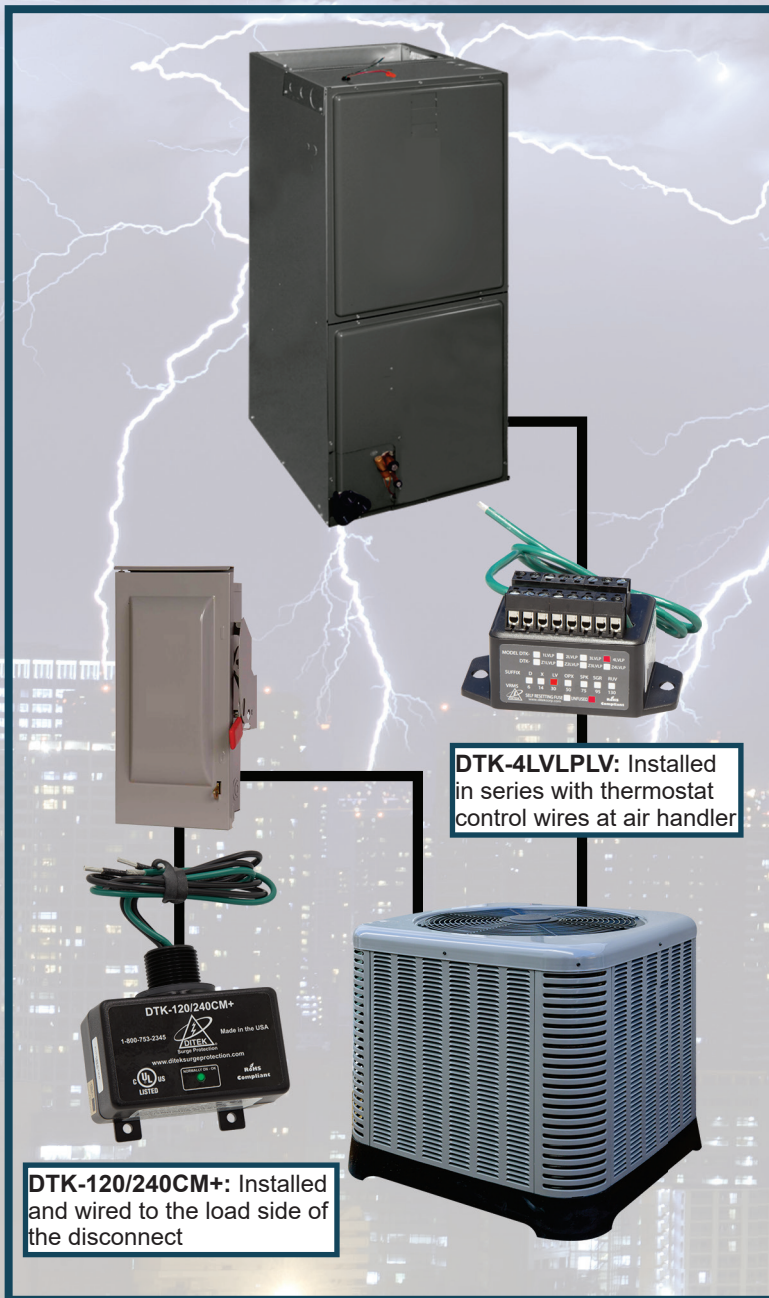
DTK-4LVLPLV: Installed in series with thermostat control wires at air handler